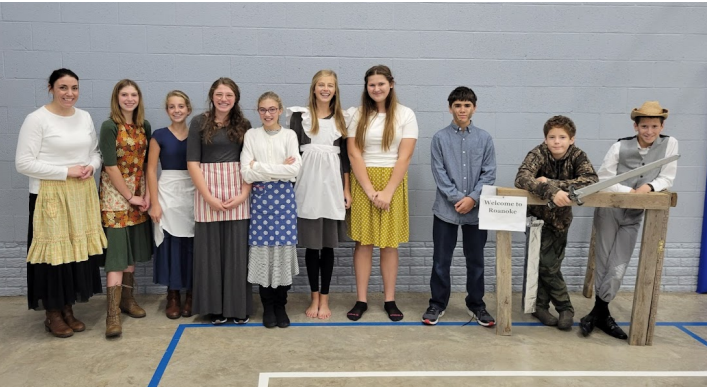
Grades 7-8 become colonists in history class November 2021