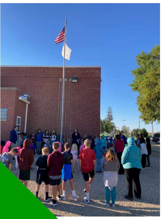
See You at the Pole September 2021

Timothy Christian School serves 30 families that attend 20 different churches in the area.