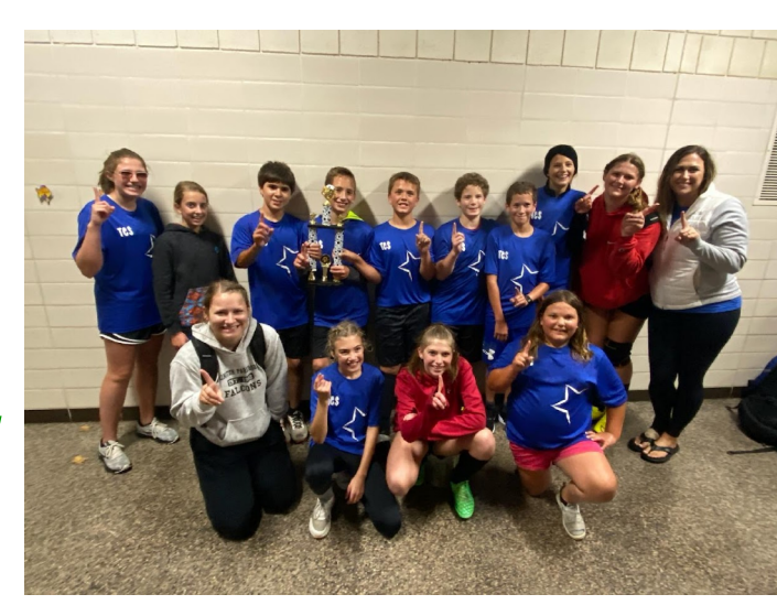
Grades 6-8 won soccer tournament September 2021

Therefore encourage one another and build each other up, just as in fact you are doing. 1 Thessalonians 5:11