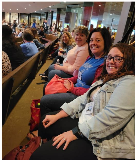
Teachers attend Heartland Christian Educators Convention October 2021