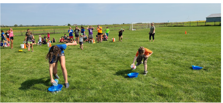
Water games during PE September 2021