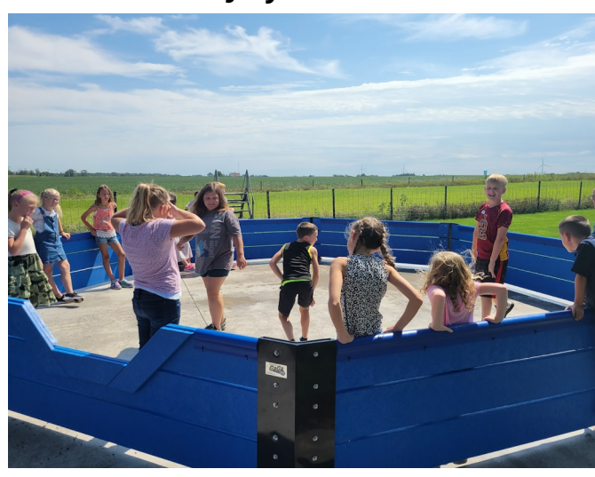
New GaGa ball pit for playground August 2021