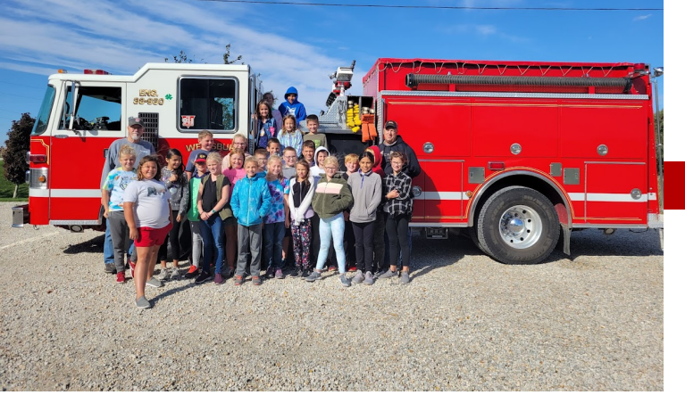
Grades 3-6 with Wellsburg Fire Department October 2021