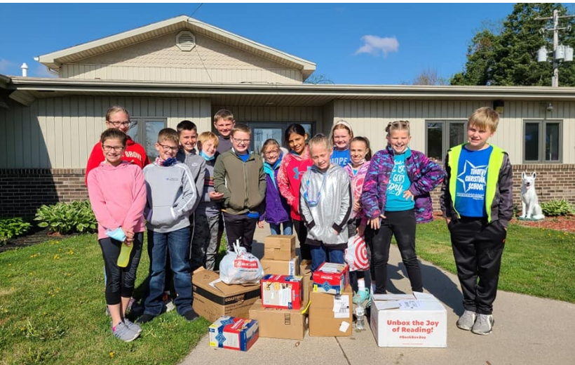
Grades 3 & 4 delivered dog toys and visited the Marshalltown Animal Rescue League.