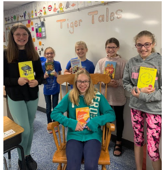
Tiger Tales team got 8th place in Battle of the Books.

And whatever you do, whether in word or deed, do it all in the name of the Lord Jesus, giving thanks to God the Father through him. Colossians 3:17