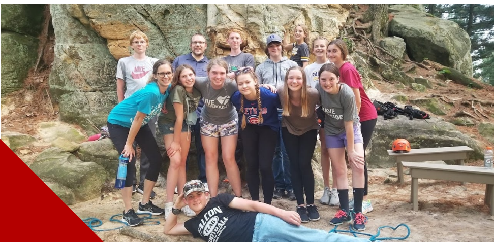
Grades 7 & 8 went to Village Creek Bible Camp.

And whatever you do, whether in word or deed, do it all in the name of the Lord Jesus, giving thanks to God the Father through him. Colossians 3:17