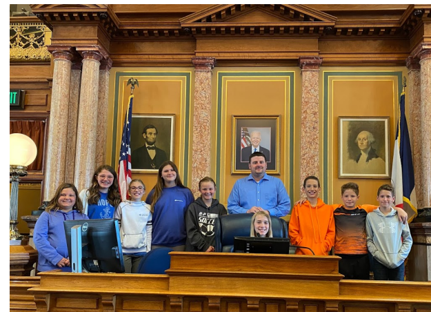
Grades 5 & 6 visited the Iowa State Capitol.