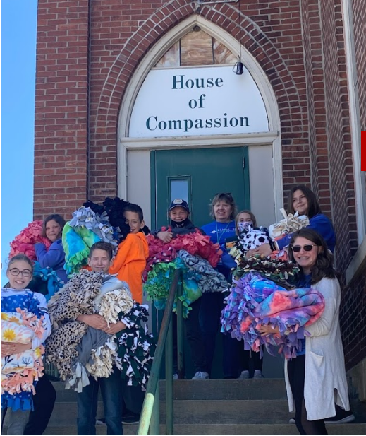
Grades 5 & 6 made fleece blankets to donate.