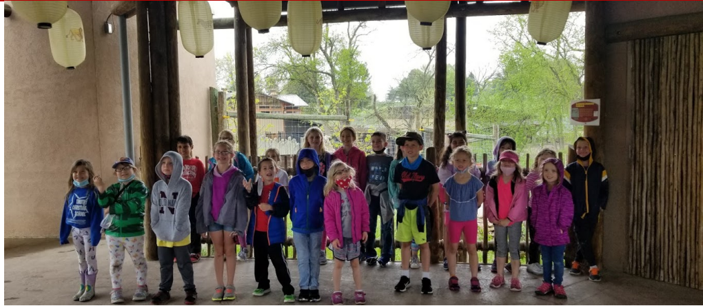
Grades K-2 went to the Blank Park Zoo.