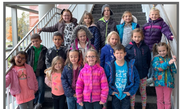
On October 28, grades K-2 traveled to Gallagher Bluedorn at UNI to see Maddi's Fridge , a performance provided through the Kaleidoscope series.