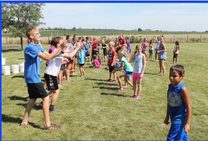
Students played water games for P.E. on August 30.