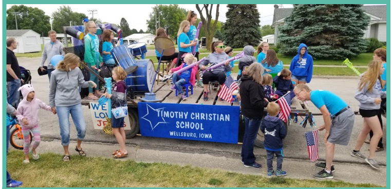
Many TCS staff, parents, and students walked in the Wellsburg Daze Parade on June 11.