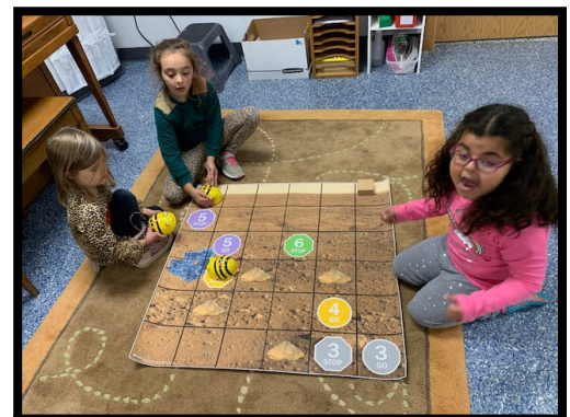
On October 25, kindergarten students learned programming skills with Bee Bots.