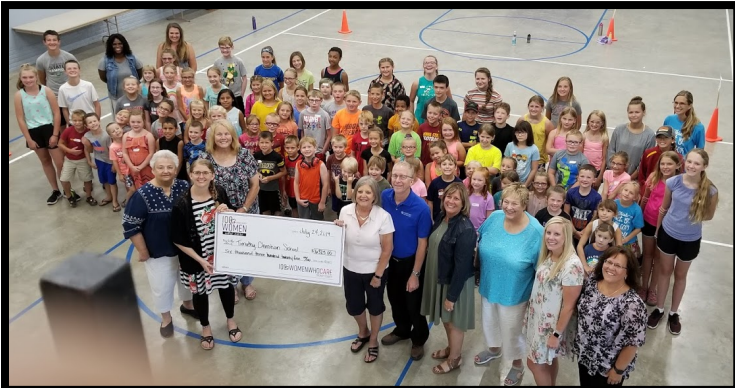
TCS received a generous donation from the 100+ Women of Grundy County for technology needs. The check was awarded during the Music and Art Jamboree in July.