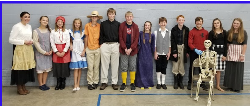
On October 23, the 7th and 8th graders were transported back to the 16th century. Each student pretended they were a member of the Roanoke Colony and hypothesized how the colony disappeared.