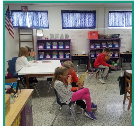
On November 1, students in grades 1-4 split up into pairs to read and pray with each other.