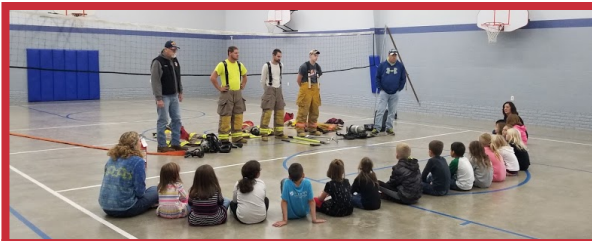
On October 11, the Wellsburg Fire Department shared some important information about fire prevention and safety with the students.