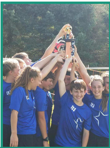
Students in grades 7-8 traveled to Hollandale Christian School in Minnesota on Friday, September 27, and won the 1st place trophy at the all-day soccer tournament.