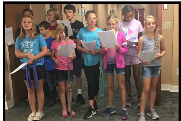
Students in grades 5-6 presented a short program and celebrated September birthdays with residents at Grand JiVante' in Ackley.

But God demonstrates his own love for us in this: While we were still sinners, Christ died for us. Ephesians 5:8