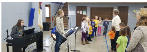
Students lead worship during chapels.