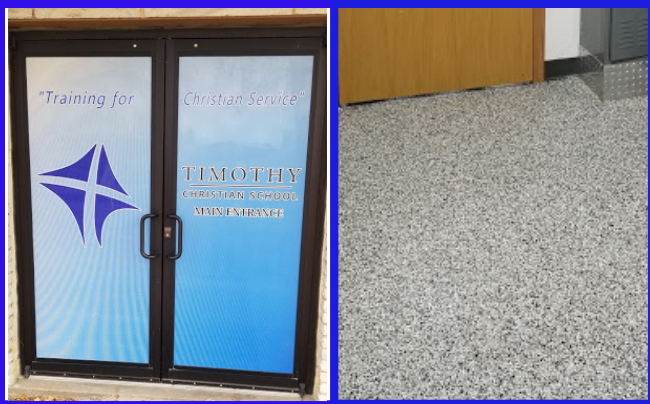
In June, new door decals and lower level flooring were installed at the school.

Be completely humble and gentle; be patient, bearing with one another in love. Ephesians 4:2