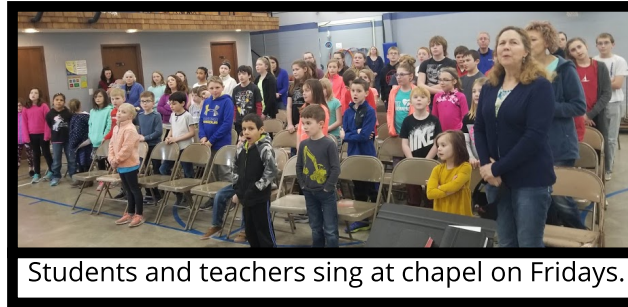
Students and teachers sing at chapel on Fridays.