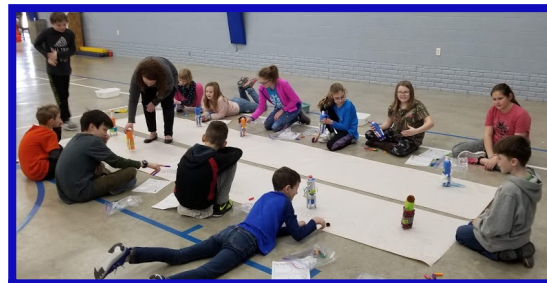
Grades 3-4 worked on their Art Bots for their STEM unit in science class.