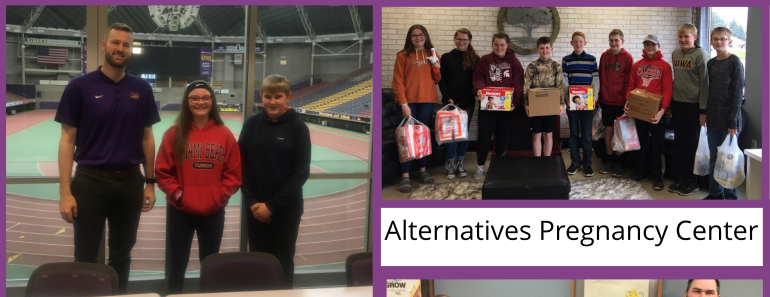
Alternatives Pregnancy Center

Grades 7-8 learned about issues that divide through the study of the Civil War. This led to students studying other areas that divide and coming up with ways to show love by bridging the gap and reflecting Christ's image.