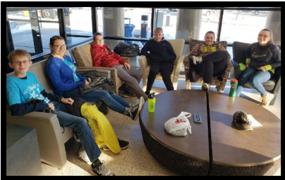
Grades 7-8 participated in MATHCOUNTS at Hawkeye Community College on Friday, February 15.