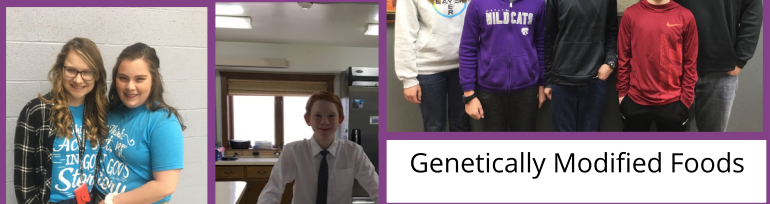
Genetically Modified Foods