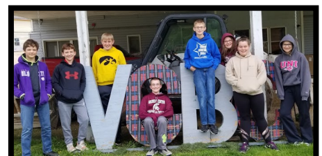
Grades 7-8 attended Village Creek Bible Camp on May 20-21.