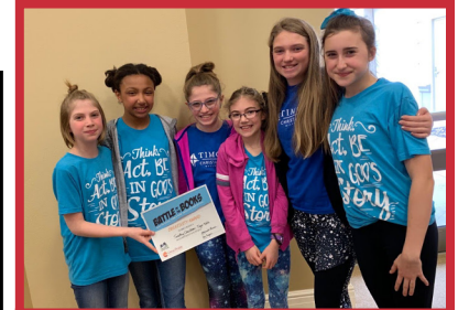
TC had 6 students represent the school at the Battle of the Books competition in Cedar Falls on April 4. They earned the Creativity Award for their team name, the Tiger Tails.