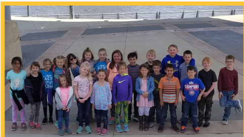
Grades K-2 visited the Phelps Youth Pavilion and Grout Imaginarium in Waterloo on Friday, May 10.

But in your hearts reverence Christ as Lord. Always be prepared to give an answer to everyone who asks you to give the reason for the hope that you have. But do this with gentleness and respect. 1 Peter 3:15