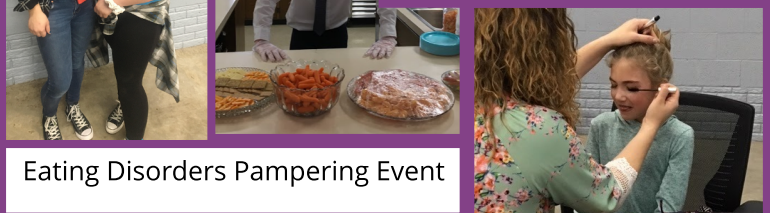
Eating Disorders Pampering Event