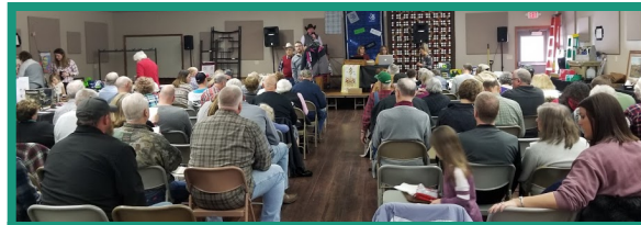
We had a great turn out for our auction on Saturday, March 2. Thanks to all the donors and guests who made this a success!