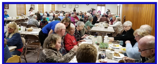
The annual Steak Supper was at 1st Christian Reformed Church on Tuesday, March 19.