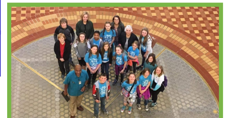
Grades 5-6 toured the State Capitol on Tuesday, May 14.

But in your hearts reverence Christ as Lord. Always be prepared to give an answer to everyone who asks you to give the reason for the hope that you have. But do this with gentleness and respect. 1 Peter 3:15