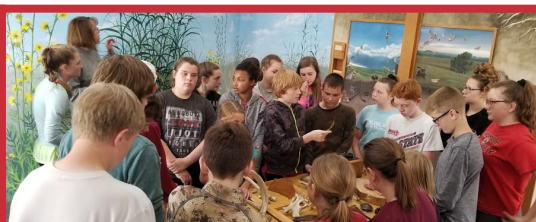
The entire school went to the Fossil and Prairie Preserve on Wednesday, May 29.