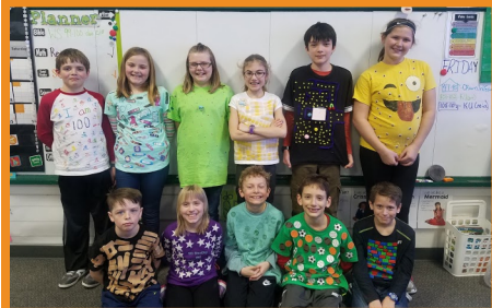
Grades 3-4 students did special math activities for the 100th Day of School on Monday, February 18.