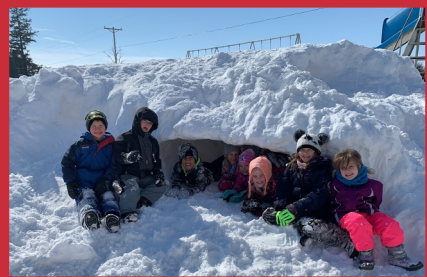
Kindergarten had fun in the snow on Friday, February 22.