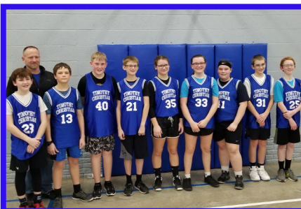
TCS held its annual b-ball tournament. Students in grades 7-8 played in the tournament while some girls in grades 5-6 led the students in cheers. February 1, 2019