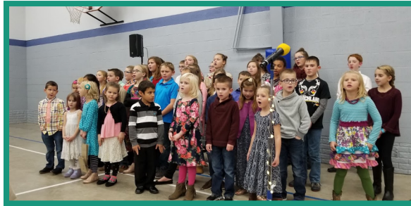
Students singing at Harvest Supper November 13, 2018