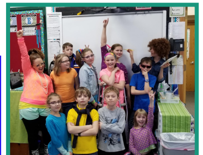
Grades 3-4 on 80s Day February 7, 2019