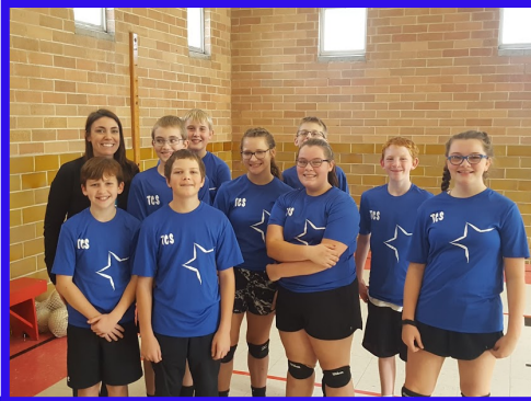
Volleyball Tournament at St. Paul's Lutheran School in Latimer, Iowa November 16, 2018