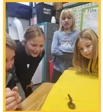
Grades 1-4 ISU Insect Zoo December 13, 2018