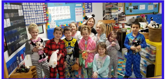
Kindergarten on Pajama Day February 4, 2019