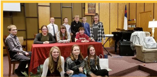
K-8 Fall Music Program November 20, 2018