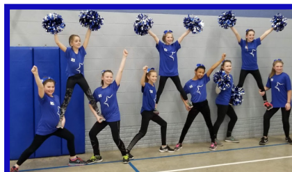
Cheerleaders at B-ball Tourney February 1, 2019

Start children off on the way they should go, and even when they are old they will not turn from it. Proverbs 22:6