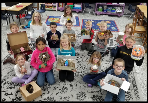
Grades 1-2 with clay bird projects in science

But I trust in your unfailing love; my heart rejoices in your salvation. I will sing the Lord's praise, for he has been good to me. Psalm 13:5-6