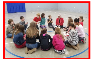
Grades 5-6 Games Valentine's Day