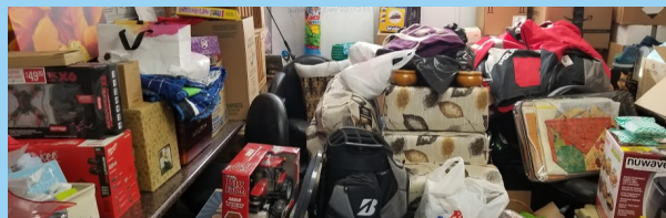
Items stored at TC for the auction