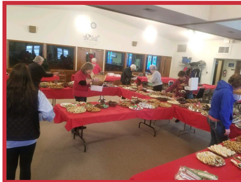
Cookie Walk December 7, 2018