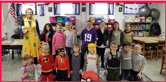
Grades 1-2 on Favorite Character Day February 5, 2019