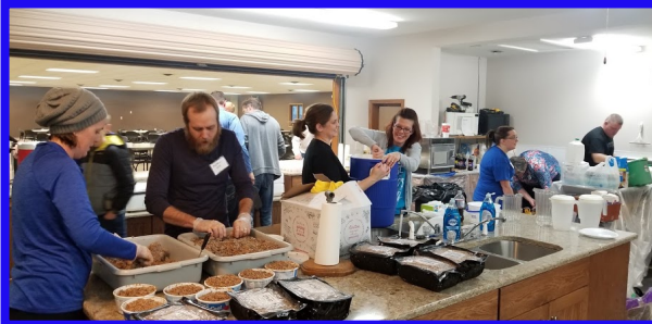
TC Parents preparing and serving Spec' N Dicken January 7, 2019